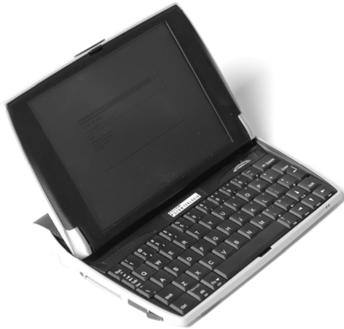
Figure E1. The Netbook Pro 2003 angle view (23.5 x 18.4 x 3.5 cm).