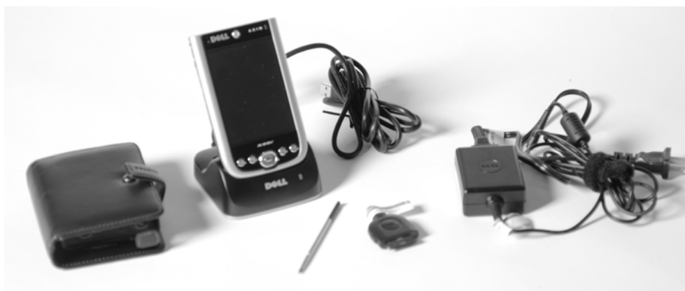
Figure E12. The Dell Axim X50v with AC adapter, case, stylus, and synchronization dock.