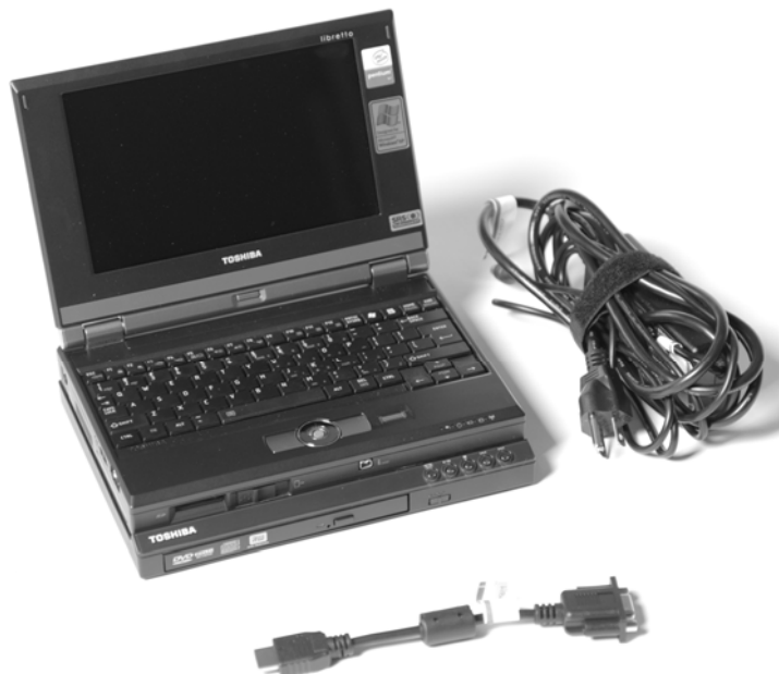
Figure E10. The Toshiba Libretto U100 with AC adapter, USB cable, monitor adapter, and placed in docking station.