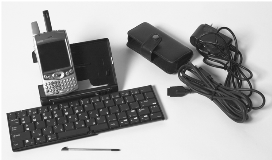
Figure E14. The Palm Treo 600 with stylus, keyboard, power and synchronization cables.