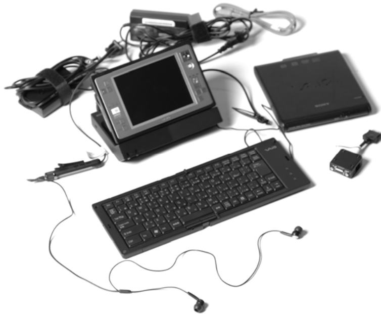
Figure E6. Sony Vaio U71/P with AC adapters, DVD drive, fold out keyboard, earphones, and LCD monitor adapter.