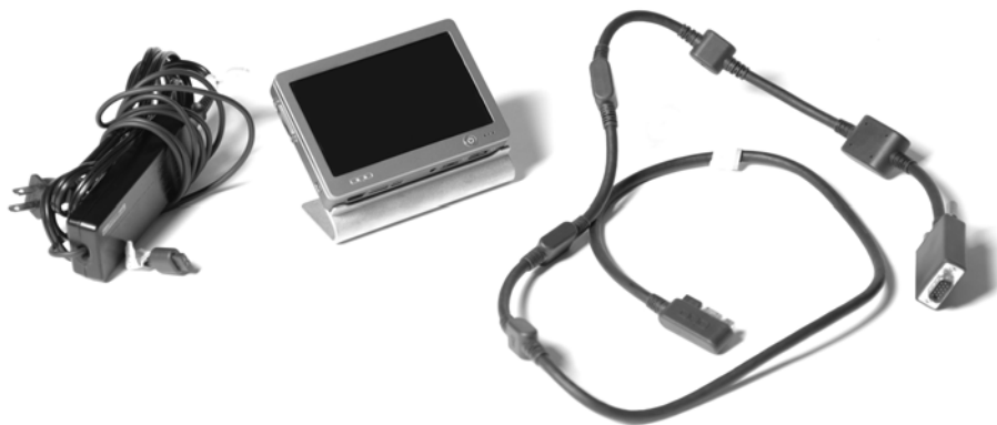
Figure E8. The OQO 01 with AC adapter and docking cable.