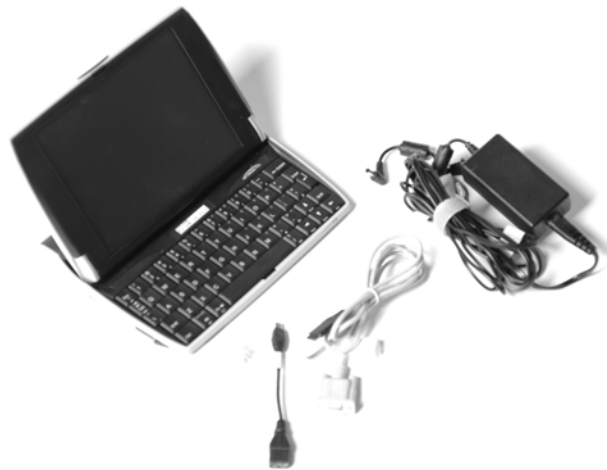
Figure E2. The Netbook Pro with AC adapter, USB cable, and RS 232 cable.