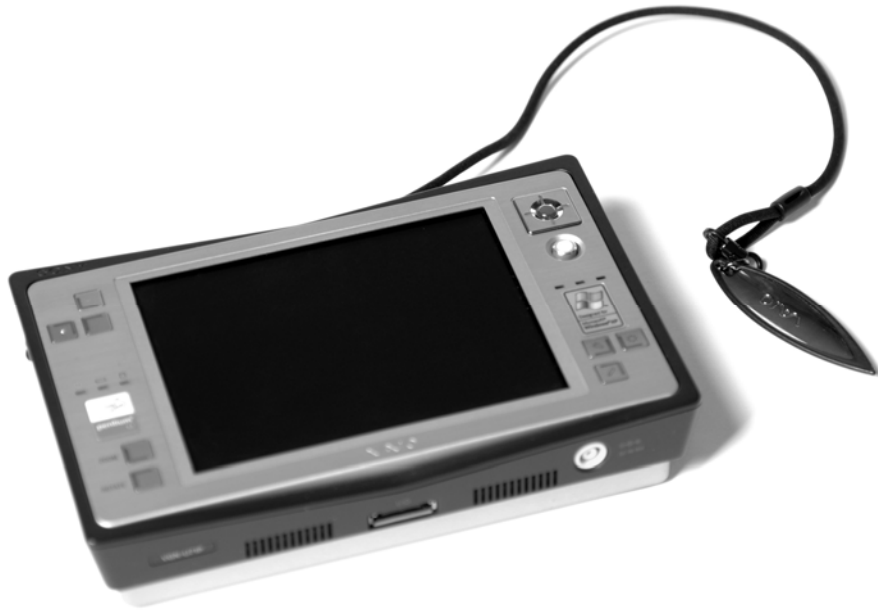
Figure E5. Sony Vaio U71/P with attached stylus (16.7 x 10.8 x 2.64 cm).