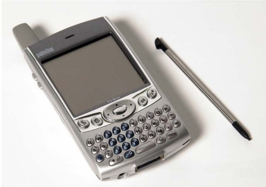
Figure E13. The Palm Treo 600 with stylus (11.2 x 6.0 x 2.2 cm).