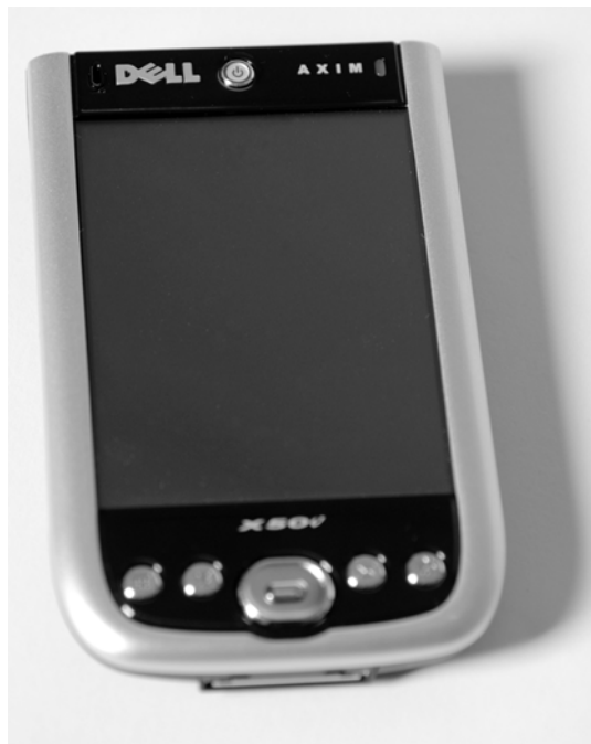
Figure E11. The Dell Axim X50v front view (11.9 x 7.3 x 1.69 cm).