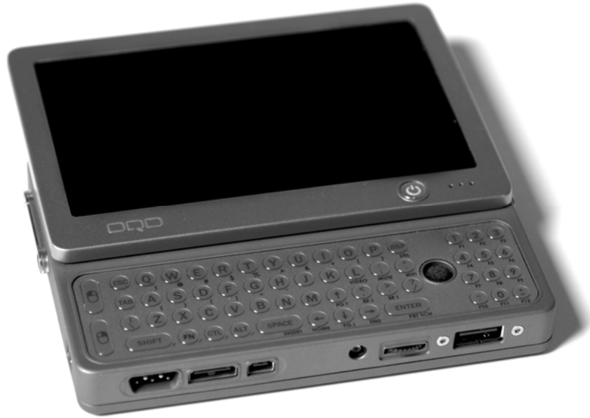
Figure E7. The OQO 01 with QWERTY keyboard exposed (12.44 x 8.64 x 2.29 cm).