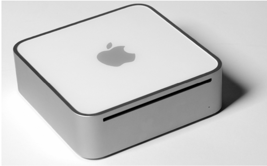
Figure E3. The Mac Mini angle view (5.08 x 16.51 x 16.51 cm).