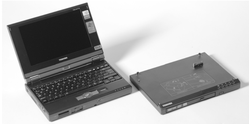
Figure E9. The Toshiba Libretto U100 with dock (21 x 16.5 x 2.98 (Front) – 3.34(Back) cm).